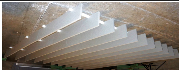
Specimen as tested (image inverted to depict ceiling installation)